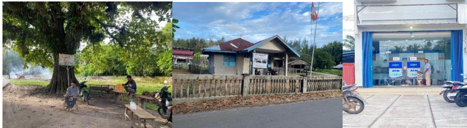
Source: Author Documentation, 2024 FIGURE 6. Ticket Sales Point and TNI Security Post

From the discussion above, it can be concluded that the Tiku Beach area has the potential to be pioneered and developed into a tourist destination in Tanjung Mutiara District, Agam Regency with the concept of developing marine tourism. Of the four tourist destination components that have been analyzed, the tourist attraction component requires creativity from the community who will manage it and the Tiku Beach Tourism Awareness Group as the spearhead of driving tourism activities in this area.